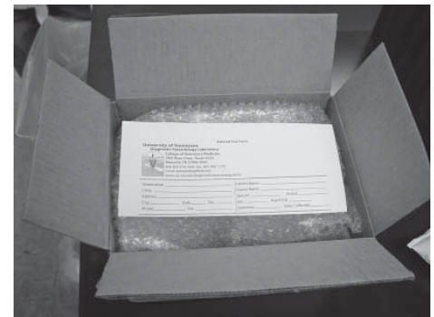
Place form outside packing materials.

4. Pad box with any absorbant material and cold packs (do not freeze)