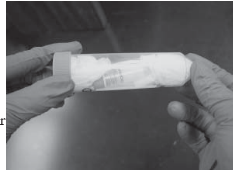
Proper secondary container

2. Wrap sealed primary container in absorbant material (paper towel etc.)