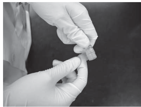
Seal around lid

Contain ALL fecal specimens in a leak-proof container.