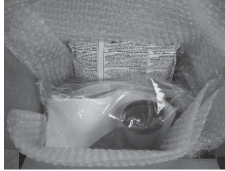
Proper triple packed specimen.

3. Place wrapped primary container in a bag or other leak proof container