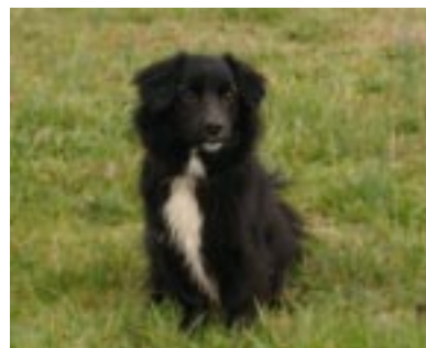
Hemingway A Spaniel mix with lots of spunk. Black with a white chest, male, 23#.