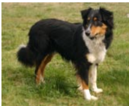
Sheldon A tri-colored rough coat collie with soulful eyes and calm manner; male, 49#.