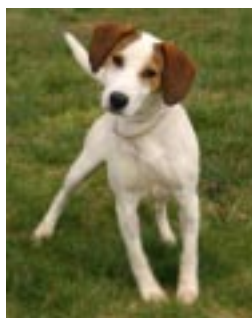
Sedgwick An inquisitive hound mix. White with brown spots, male, 30#.

For information about HALT dogs please call (865) 693-5540 Catatoga Kennels www.vet.utk.edu/halt