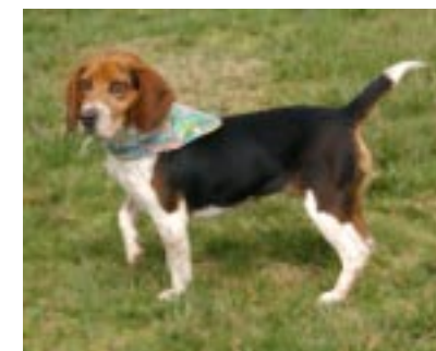
Jillian A happy little beagle with a sweet face and mild nature, female, 20#.

HALT is sponsored, in part, by the University of Tennessee College of Veterinary Medicine. Additional support by Ideal Animal Hospital, Oak Ridge. Dogs provided through an arrangement with the Young-Williams Animal Center, Knoxville. The HALT program gratefully acknowledges the contributions of its many volunteers and donors.