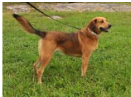
Shyla An elegant and affectionate shepherd mix with a beautiful gait. Female, 42 pounds.

For information about HALT dogs please call (865) 693-5540 Catatoga Kennels www.vet.utk.edu/halt