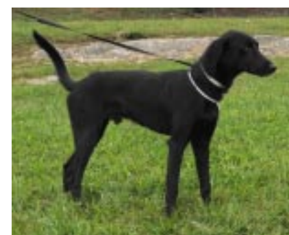
Gable A lanky and well-mannered lab/Saluki mix. Male, 58 pounds.

HALT is sponsored, in part, by the University of Tennessee College of Veterinary Medicine. Additional support by Ideal Animal Hospital, Oak Ridge. Dogs provided through an arrangement with the Young-Williams Animal Center, Knoxville. The HALT program gratefully acknowledges the contributions of its many volunteers and donors.