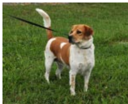
Ruby A sweet, calm Beagle mix that loves to fetch balls. Female, 34 pounds.