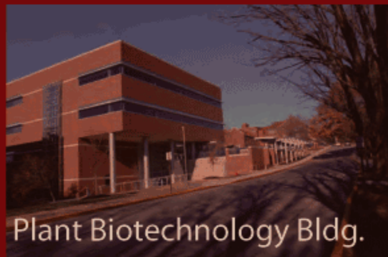
Plant Biotechnology Bldg.